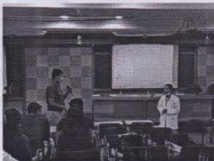
Faculties interacting in the session